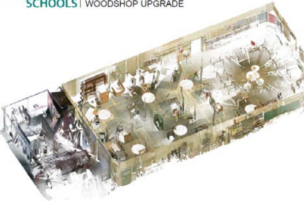
SAANICH SCHOOLS | PARKLAND SECONDARY SCHOOL WOODSHOP UPGRADE